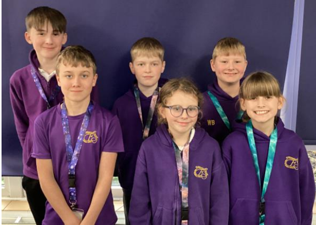
Carleton School Prefects