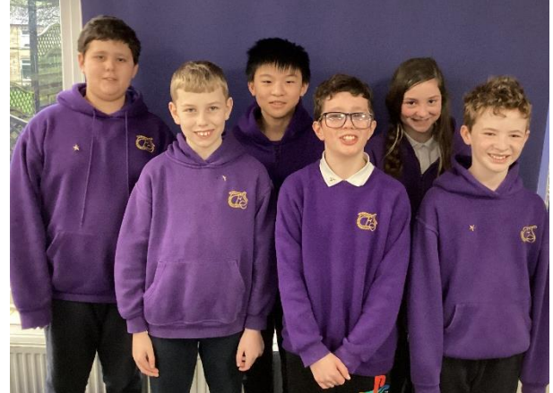
Carleton School House Captains